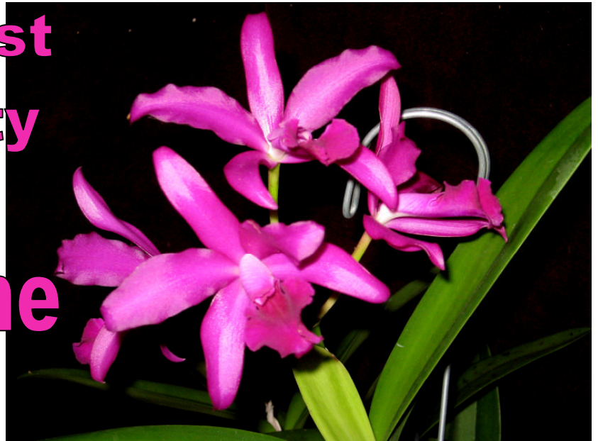
C. Bactia 'Grapewax' AM/AOS

"Originally many orchids were erroneously misclassified as Epidendrums. Eventually, Epi's, as we know them today, evolved into 3 main genera, Epidendrum, Encyclia and Prothechea (cockleshell orchids). The program will show you how to differentiate between them, and provide culture tips on how to grow them. All are members of the cattleya family, and most are easy to grow in Florida. Many have long-lasting flowers that are floriferous and fragrant, providing us with a wide range of colors and shapes. Their hybrids, Epicats, have become popular in recent years."